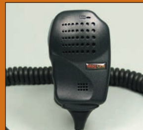
Mag One Remote Speaker Microphone PMMN4008

The following Mag One accessories have been tested with the BPR 40 to ensure maximum performance.