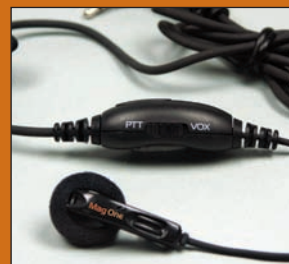
Mag One Earbud with In-line Microphone and PTT/VOX Switch PMLN4442