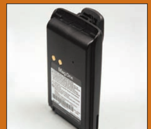
Mag One 1200mAh NiMH Battery PMNN4071_R