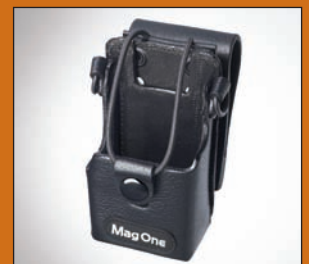
Mag One Hard Leather Case PMLN4742