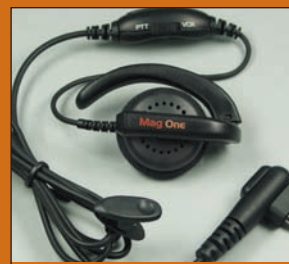
Mag One Ear Receiver with In-line Microphone and PTT/VOX Switch PMLN4443_B