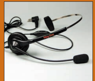
Mag One Ultra Lightweight Headset with In-line PTT/VOX Switch PMLN4445